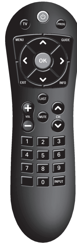
OCE-0189B REV 04 (03/19/21)